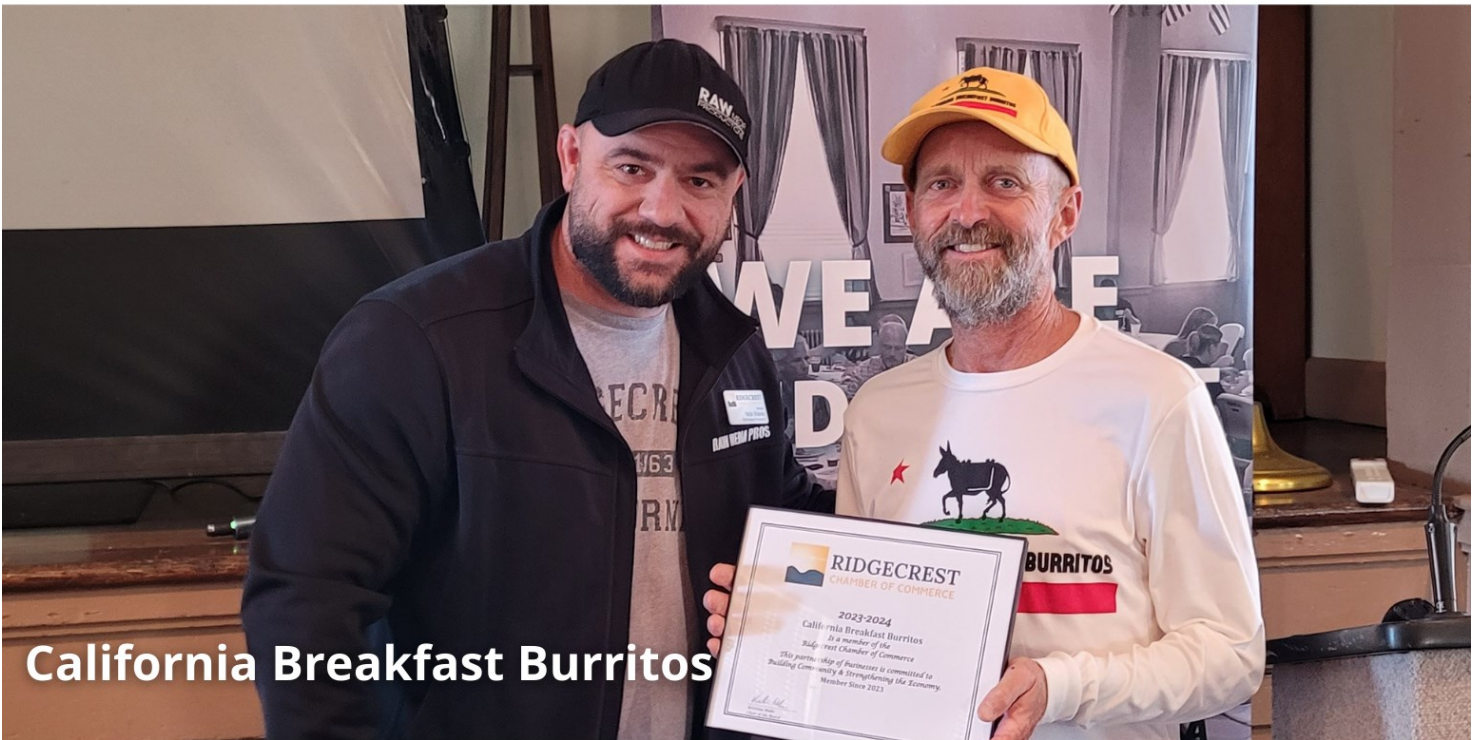
California Breakfast Burritos