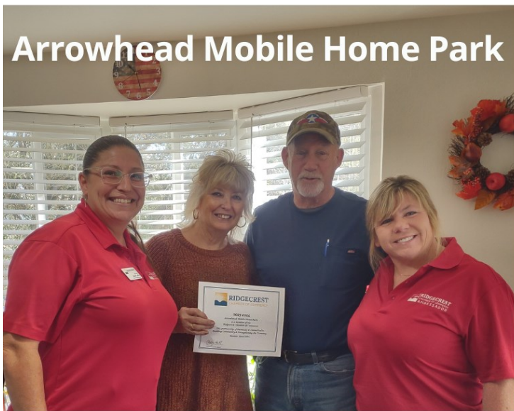
Arrowhead Mobile Home Park