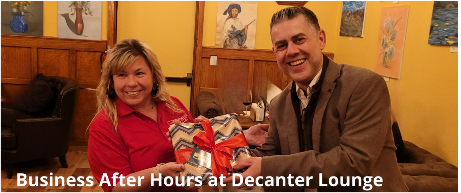
Business After Hours at Decanter Lounge