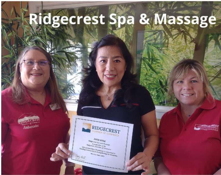
Ridgecrest Spa & Massage