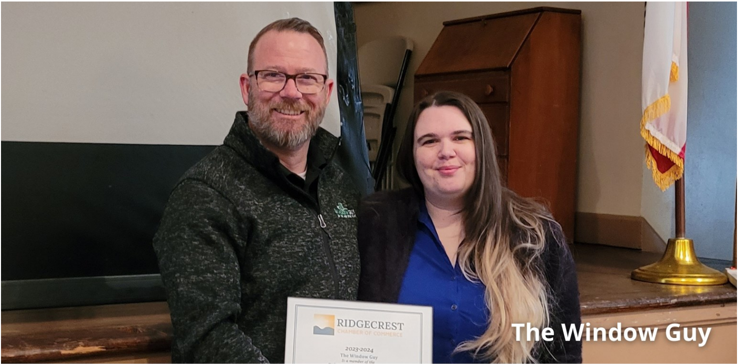
The Window Guy