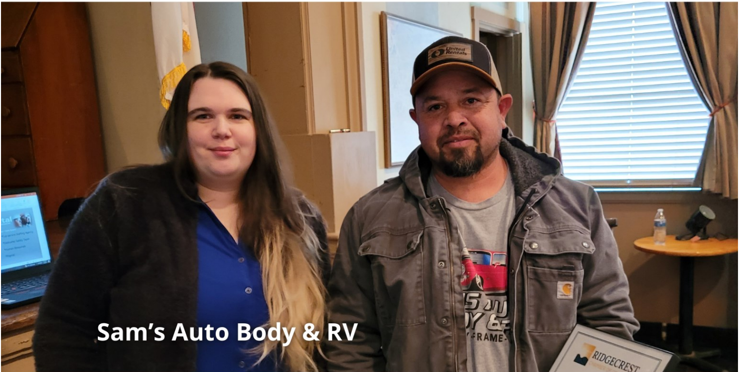
Sam's Auto Body & RV