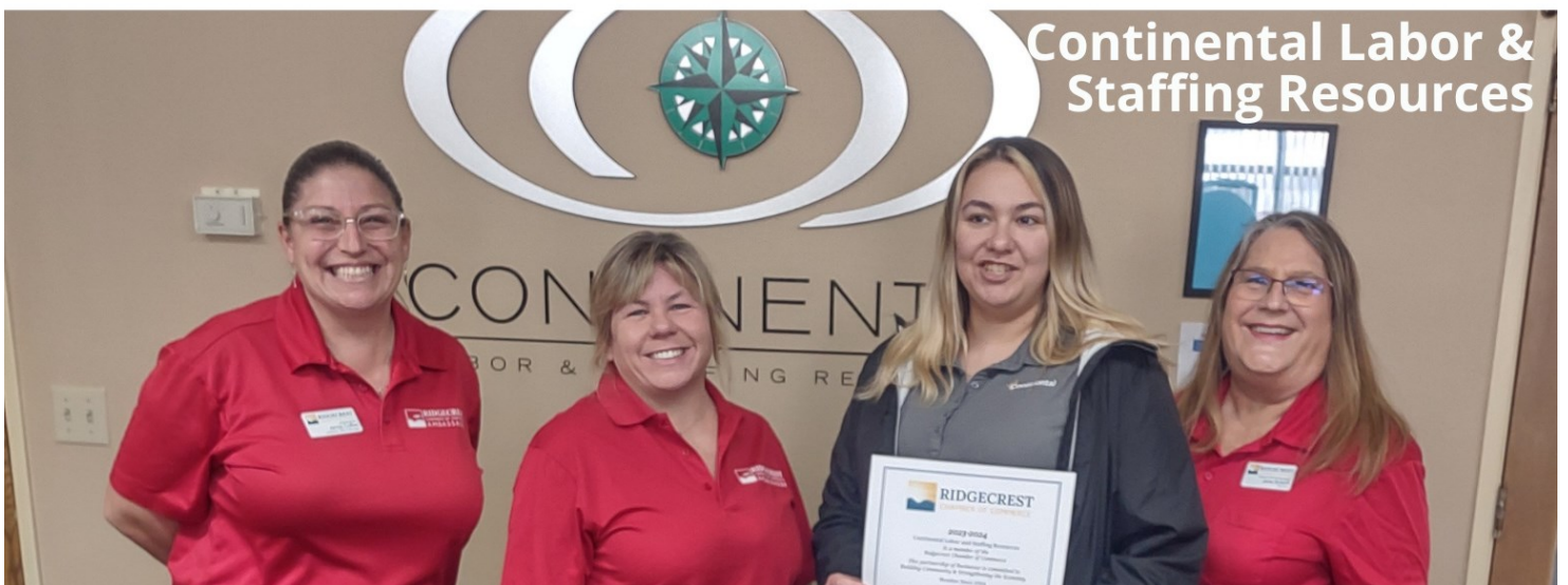
Continental Labor & Staffing Resources