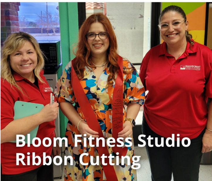
Bloom Fitness Studio Ribbon Cutting